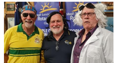
All the shinanigans at the Quiz Night