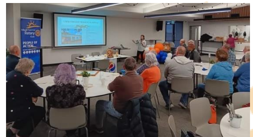
Our birthday meeting 14 MAY24